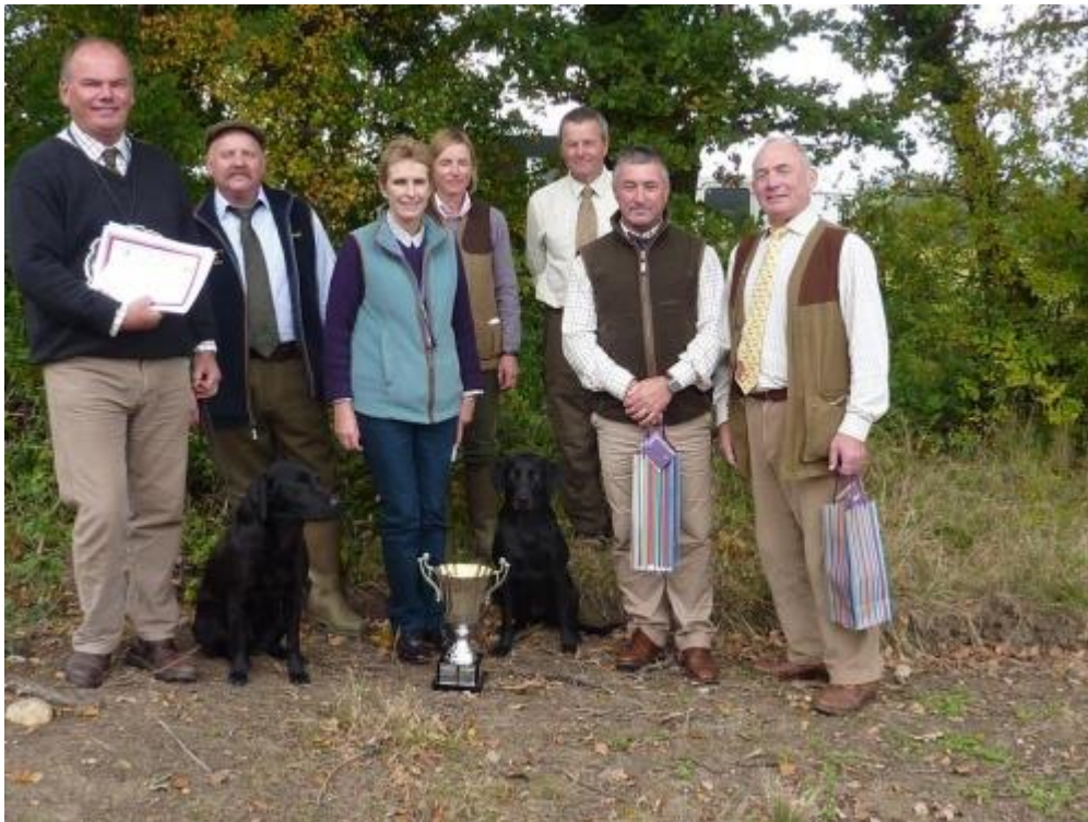
Stake 2 Award Winners & Judges