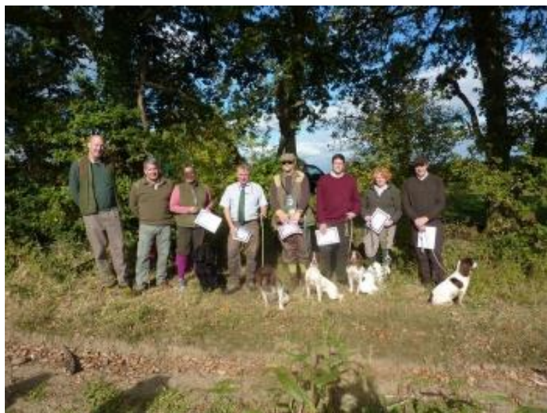
Award Winners & Judges