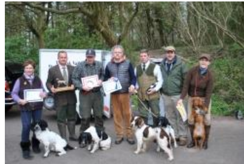
Open Award Winners and Judges