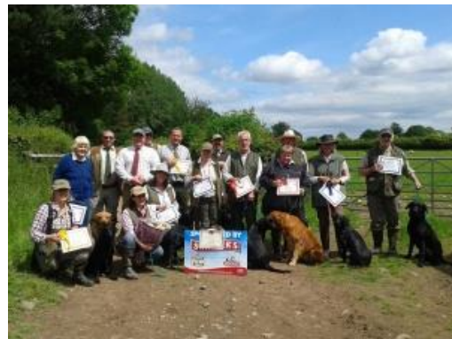
Puppy and Novice Award Winners and Judges