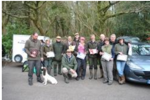
Puppy & Novice Award Winners and Judges