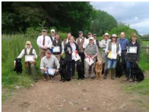
NDNH & Open Awards Winners and Judges